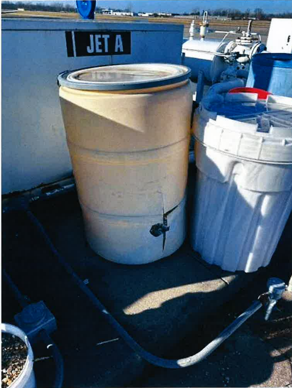
Fuel Island. Yellow barrel absorbent material damaged.