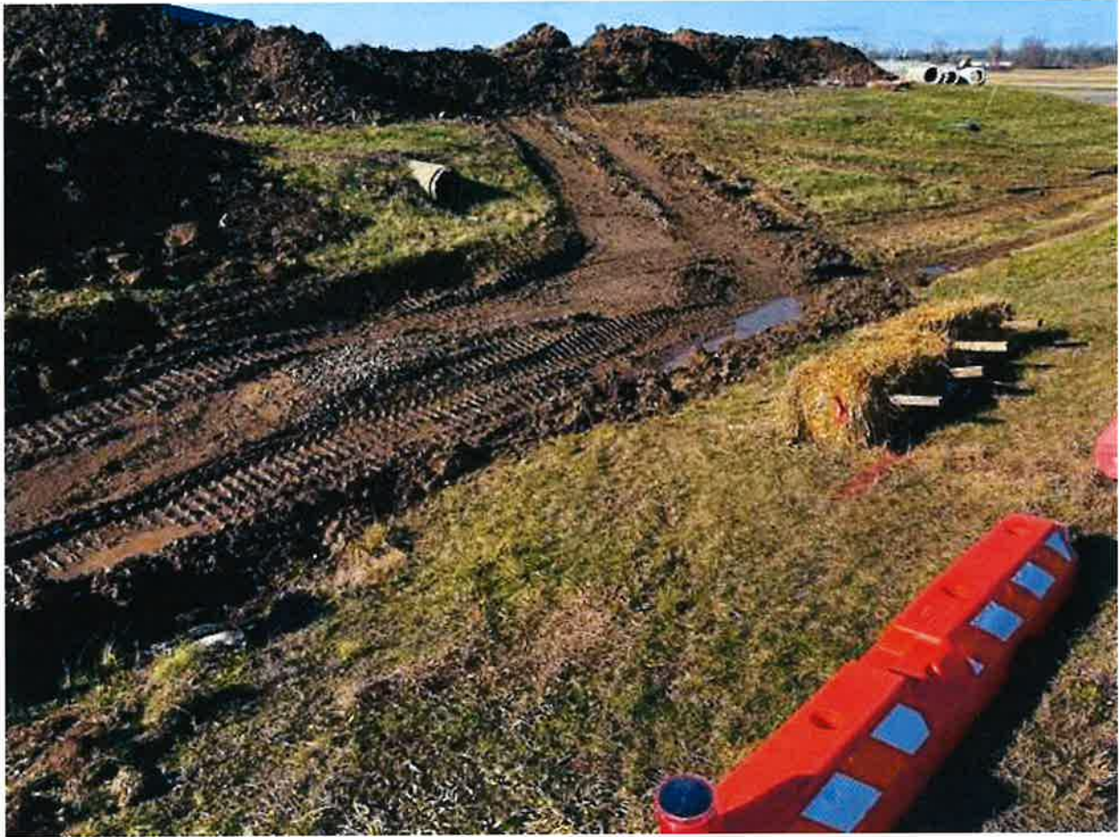
Temporary removal of sediment barrier at hangar construction site.