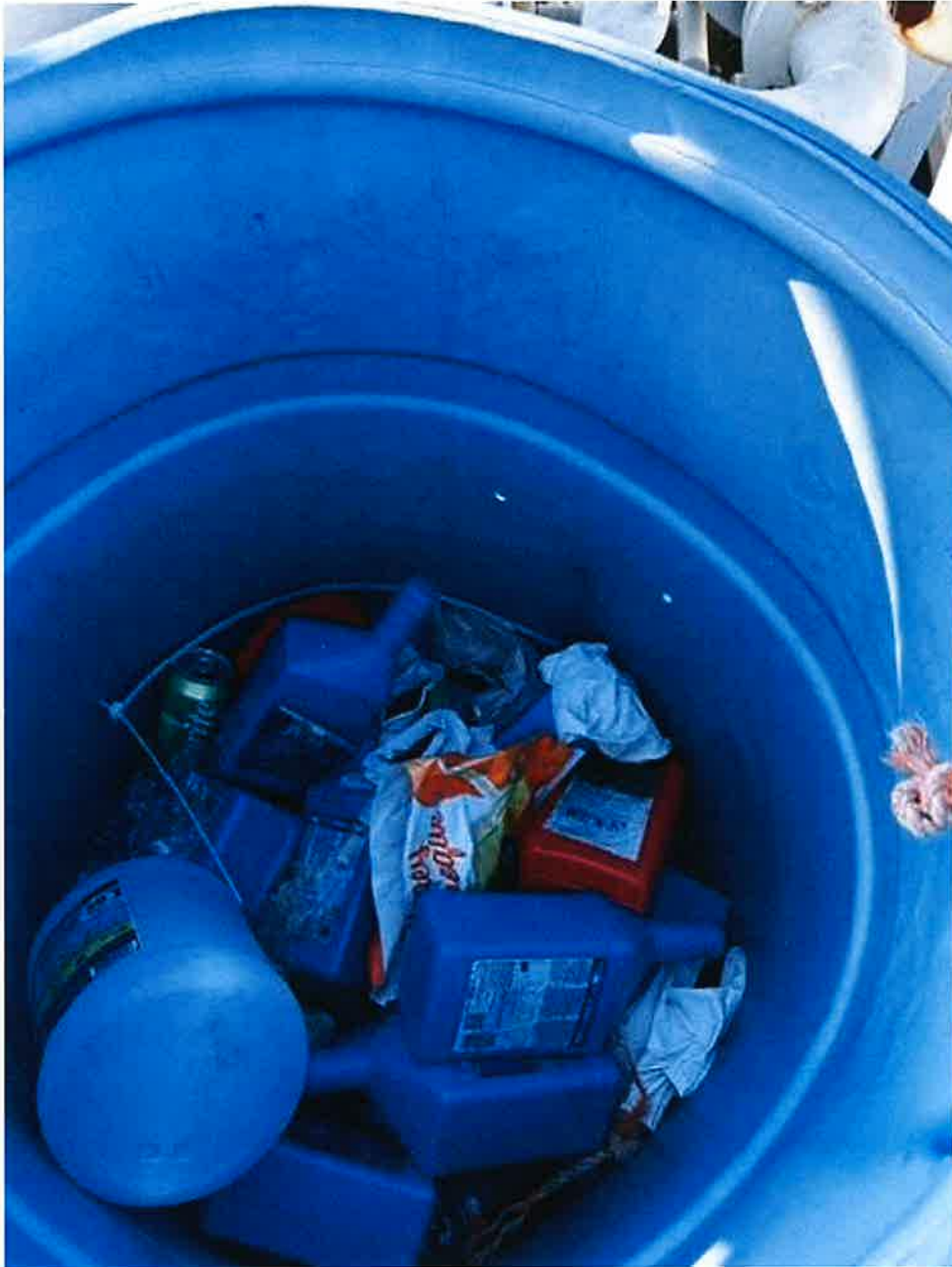
Fuel Island. Barrels uncovered mixed with trash and water.